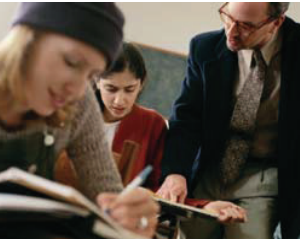
Odd Fellows are very involved in supporting their communities through a variety of civic projects.

In 18th century England, it was odd to find people organized for the purpose of giving aid to those in need and pursuing projects for the benefit of all mankind. Those who belonged to such an organization were called "Odd Fellows." Odd Fellows are also known as "The Three Link Fraternity" which stands for Friendship, Love and Truth.