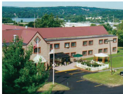
The Independent Order of Odd Fellows is proud to sponsor many Housing Projects throughout North America.