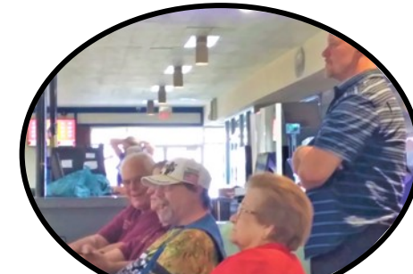
Talk to Us