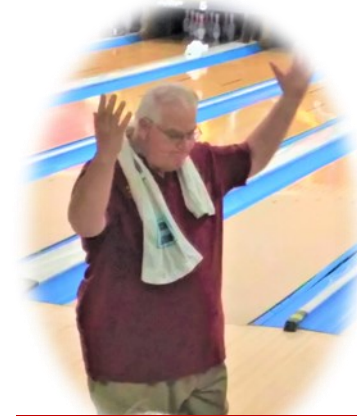
Party With Us