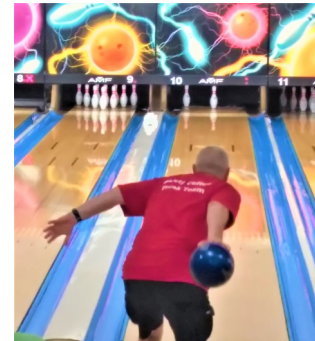
Bowl With Us