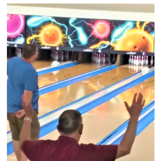
Be With Us