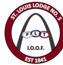
New Lodge Pin

IT TAKES ONE TO GET ONE. (Adapted from anonymous poem)