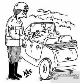
Search by: kenneth009 "When I asked to see your licence I meant your driving licence, not your dog licence."