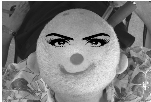
Can you guess who I am answer at bottom of page 5

We hope to see everyone here again in 2016!