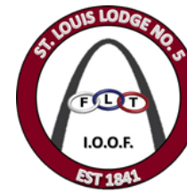
New Lodge Pin