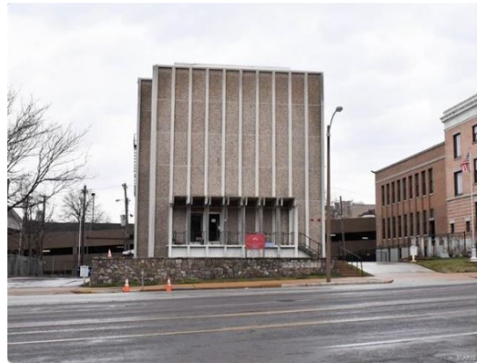
Old Odd Fellows Building 3765 Lindell Blvd. St. Louis, Mo.