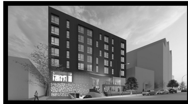
New Apartment Building 3765 Lindell Blvd. St. Louis, Mo.

Well it's finally happen. Our new building located at 350 North Valley Dell Dr., Fenton, Mo. is done except for putting things away. We will be holding our first evening meeting on December 5, 2020. (Past Grand Night). Below are a few pictures of what it currently looks like.